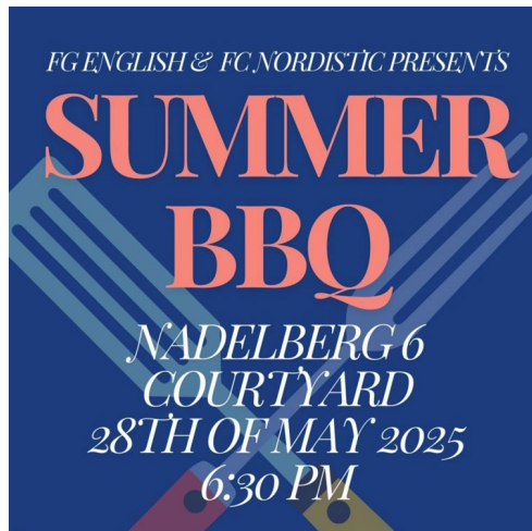
Figure 6. Poster for Student Association's Summer BBQ