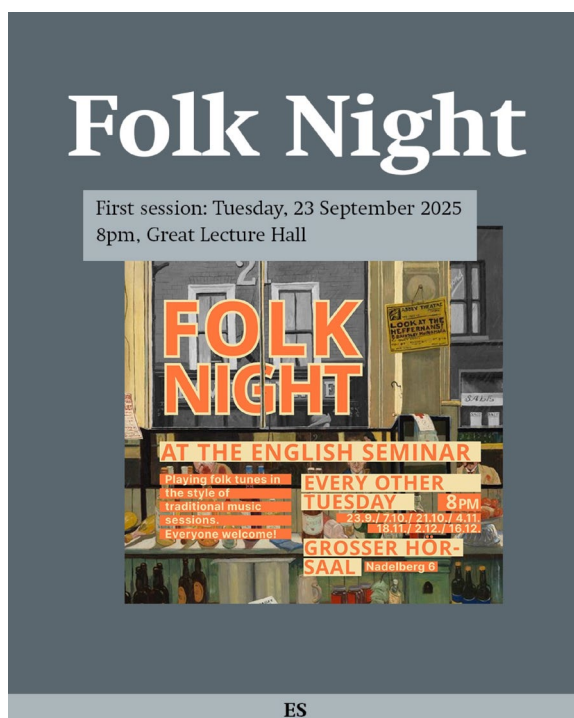
Figure 7. Poster for Folk Night

The English Seminar Folk Night , which took place every other Tuesday in the Grosser Hörsaal, was a big success. Students either brought their instruments and joined in or came along to listen and enjoy the atmosphere.