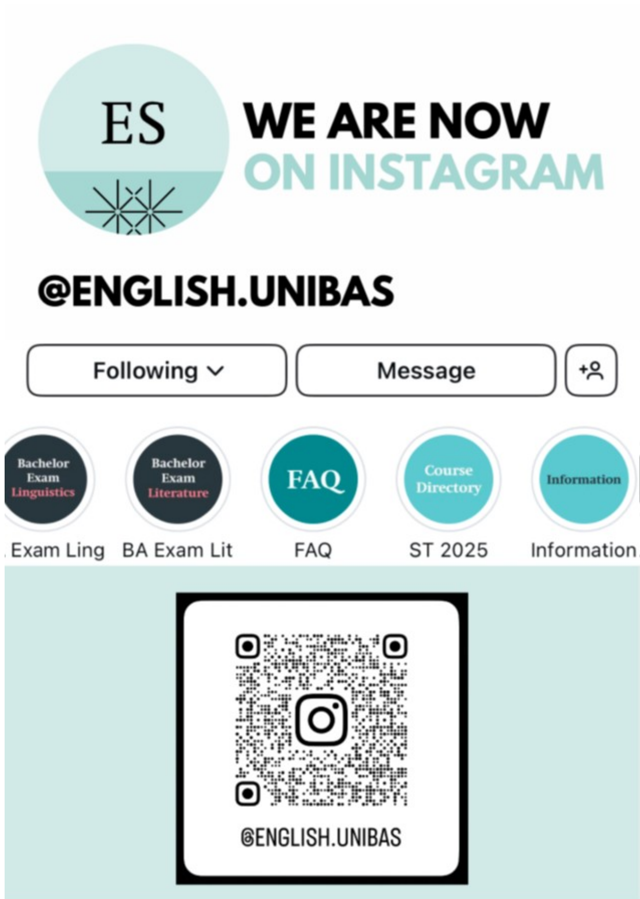
Figure 10. Flyer Department of English on Instagram