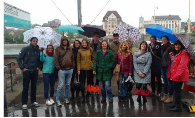
Staff excursion to Schweizerhalle