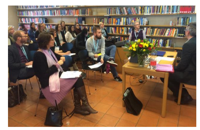
Session at the international conference Language and Health Online: Typing Yourself Healthy