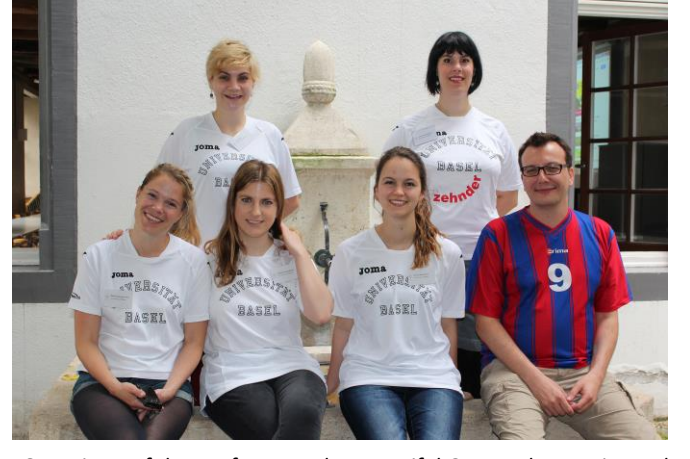
Organizers of the conference The Beautiful Game: The Poetics and Aesthetics of Soccer in Transnational Perspective