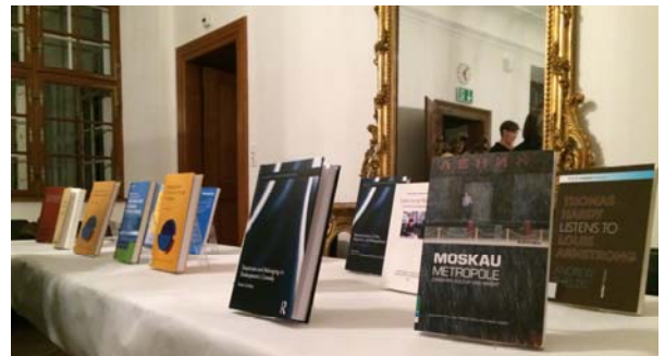
Display of the 2015 publications at the book launch party