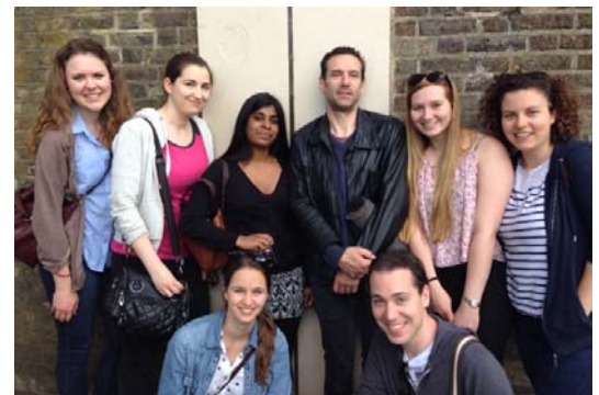
Participants of the London Field Trip